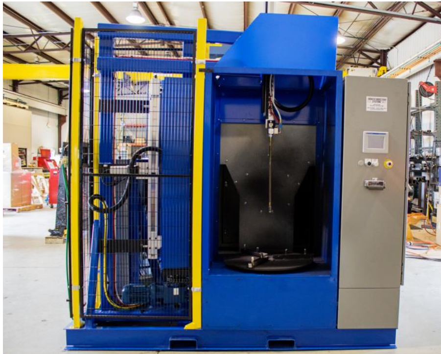
Quick Change Spray Guns Outside spray gun on linear actuators for XY 360 degree inside gun for smaller tires