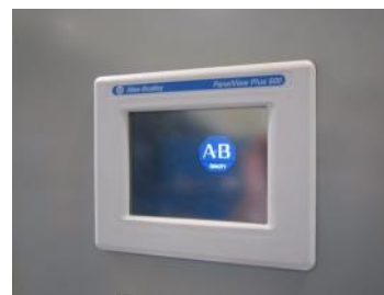
Allen Bradley Controller and HMI touchscreen