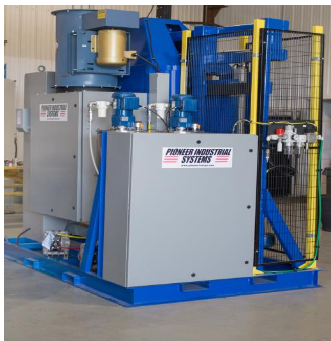
Modular Design with Integrated Filter Box and Exhaust