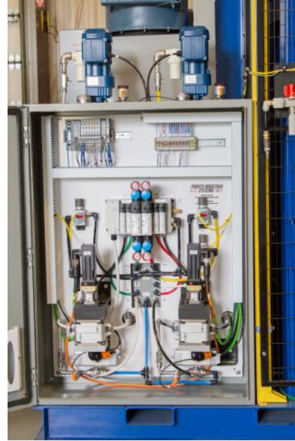
Precision fluid delivery system dual holding tanks with agitators US Patent No's 8,646,404 and 9,192,953